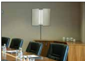
Decorative cover is ideal for use in conference rooms and office spaces

Even though synchronizing network master clocks and time servers to GPS is well-known as the standard for the most time-sensitive applications, some data centers and critical server locations are not conducive to traditional roof-top GPS antenna installation. Skylight™ provides a solution. Consisting of an indoor GPS antenna panel, a configuration of Spectracom’s SecureSync® modular GPS time server, and an interconnect cable, Skylight opens new possibilities for accurate GPS time.