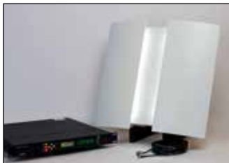
Skylight includes indoor GPS antenna panel, cable, and SecureSync GPS time Server